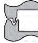
Elbow Edge Set 201-064-K