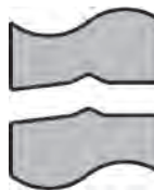
Duct Work "V" Set 201-079-K