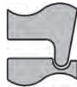
Turning Roll Set 201-053-K