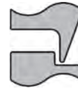
Flange Roll Set 1/4" 201-057-K 3/8" 201-056-K