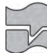
Gore Edge Roll Set 201-054-K