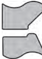
Offset Swedge Set 201-078-K