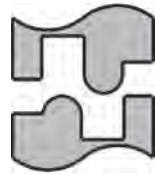
OGEE Roll Set 201-074-K