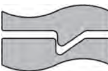
Fire Damper Set 201-055-K