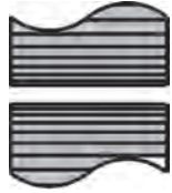
2" Wide Crimp Roll 201-003-K