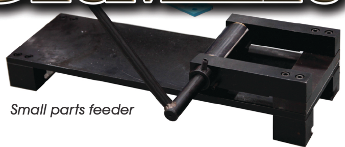
Small parts feeder